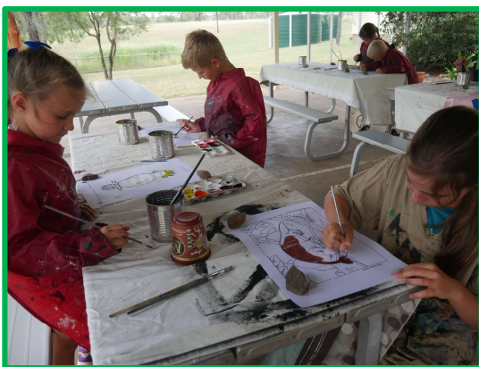
Mixing colours to paint Australian animal pictures