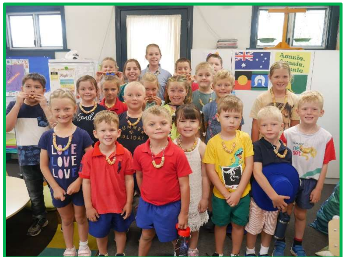
Wearing the colours of the flags