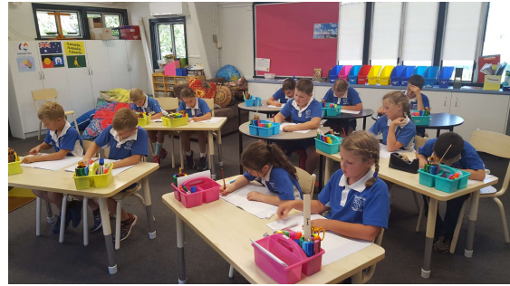
Students hard at work on their free writing.