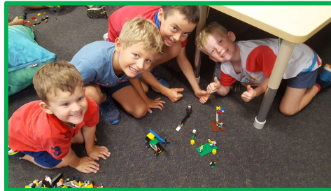
Aussie lego creations