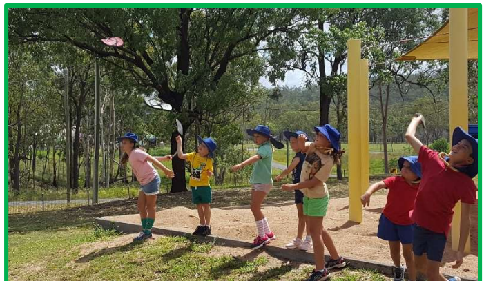
Thong throwing contest