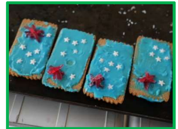
Aussie flag bikkies